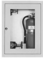
Model 282 1½ and 2½ Valve with Extinguisher