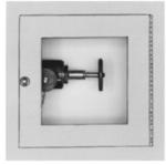
Model 280, 281 2½ Valve